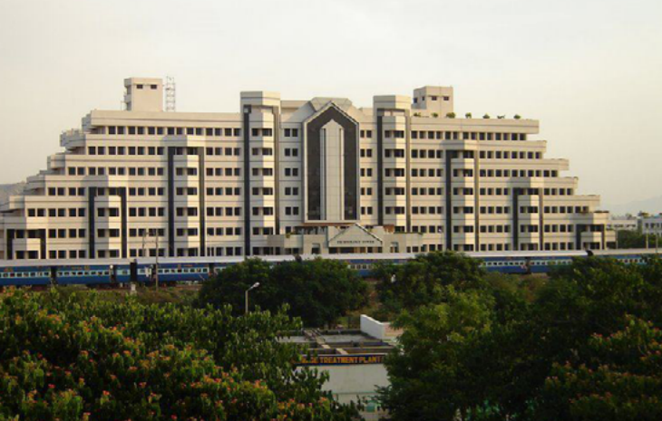
Technology Tower – The symbolic academic structure of the Vellore Institute of Technology (VIT).